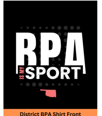
District BPA Shirt Front