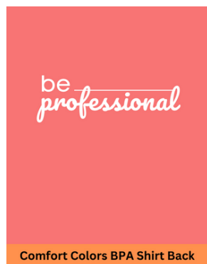
Comfort Colors BPA Shirt Back