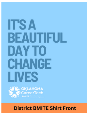
District BMITE Shirt Front