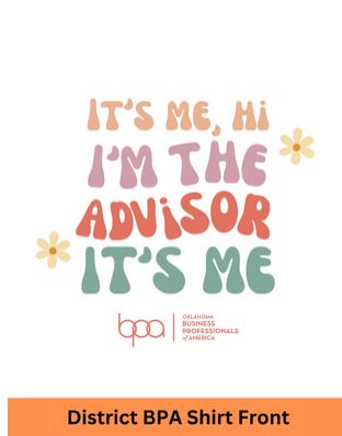
District BPA Shirt Front