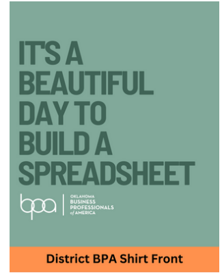
District BPA Shirt Front